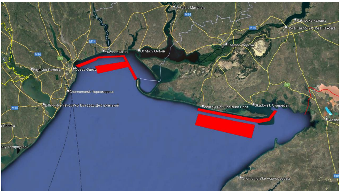
Risk Intelligence (Illustration for visual guidance only)

NAVAREA III: See above for visual guidance on mined areas according to the Spanish flag administration (NAVAREA III 0092).