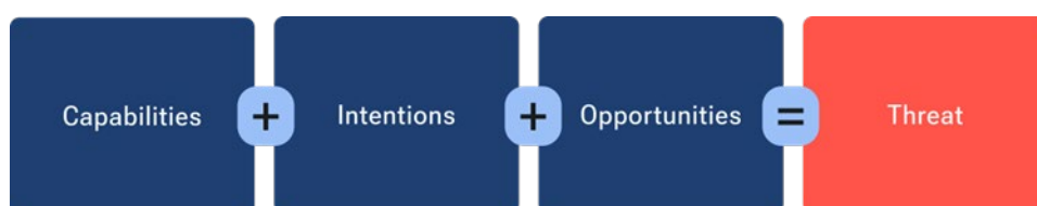
Figure 4: Risk Intelligence illustration

All threat levels are based on the likelihood of a threat type occurring, with generic consequences described in the relevant sections. All threat levels are based on an assessment of capabilities, intentions and opportunities of potential perpetrators, separated into different categories.